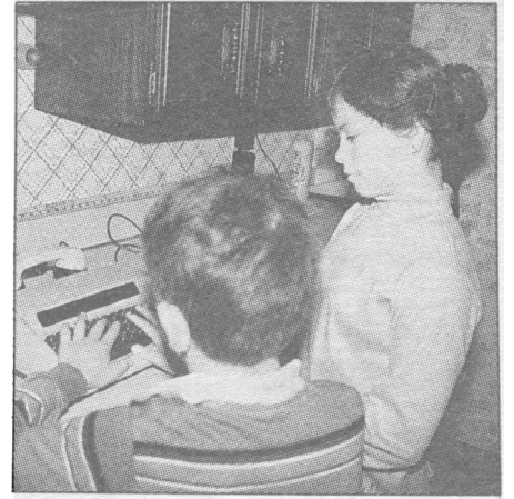
TDD. Page 5.