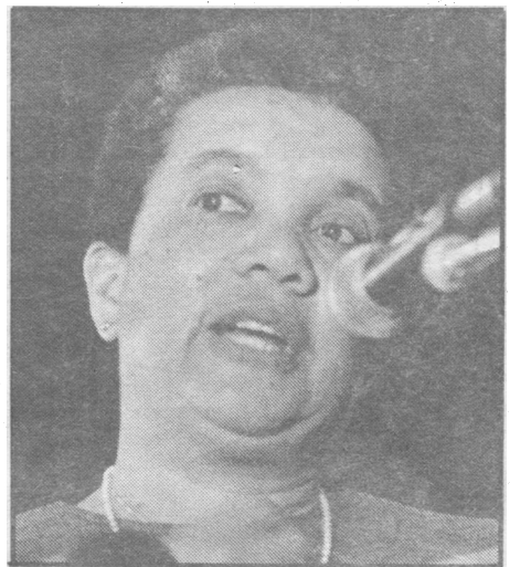
Edelman Address. Page 7.