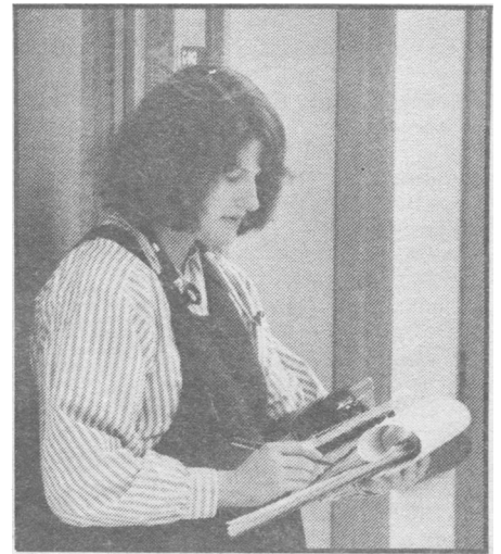
Pregnancy & residents. Page 6.

Recalls . . . . . 5 Policy Statement: Bicycle Helmets . . . . . 12 Course Calendar . . . . . 20 Membership Applicant List . . . . . 24 Classified Ads . . . . . 26