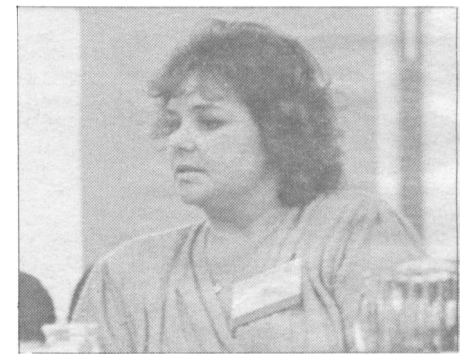
Chapter expertise. Page 5.