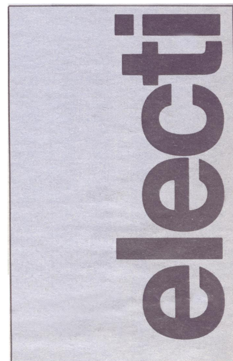
District elections. Page 8.