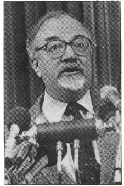
Car seat campaign. Page 2.