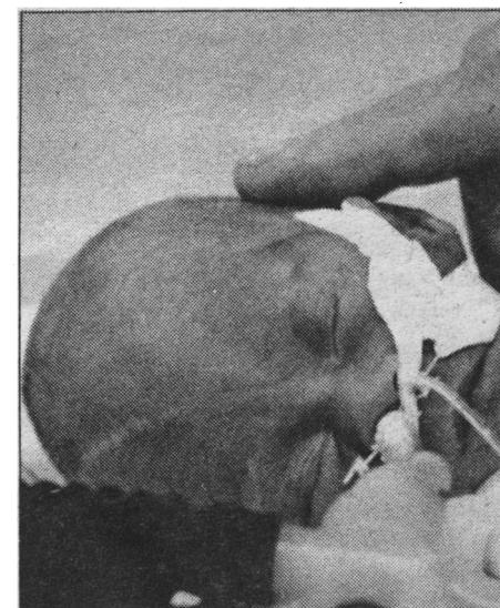
Baby Doe network. Page 4.